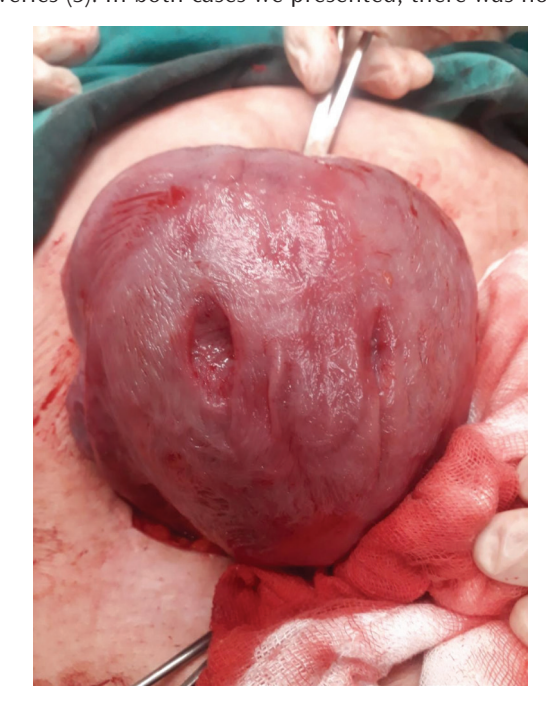
Figure 2. Uterus after removing the placenta. There are no myometrium and endometrium

PAS is a term combining various degrees of abnormal trophoblast invasion into the myometrium of the uterine wall (2). Previous cesarean section, previous uterine surgery, low lying placenta and placenta previa are important risk factors for PAS (3,4). The risk of PAS increased with increasing number of cesarean deliveries (5). In both cases we presented, there was no history